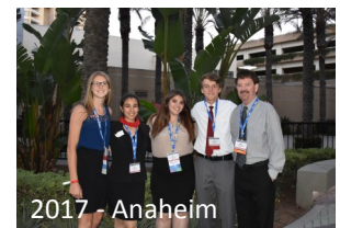
2017 - Anaheim