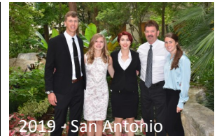
2019 - San Antonio

FUTURE BUSINESS LEADERS OF AMERICA-PHI BETA LAMBDA | 2019-20